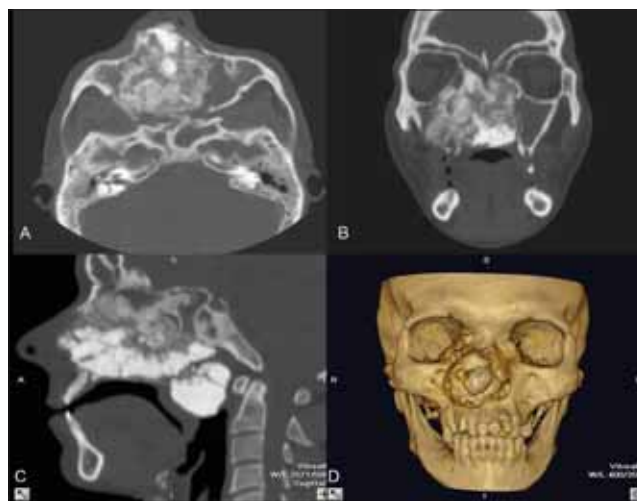
Figure 3. CT showed involvement of the third medium of the face.