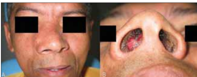
Figure 1. Facial examination: excision of the right face.