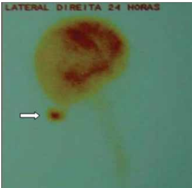
Figure 3. Cisternocintilografia - Right Side - Suggestive of cerebrospinal fluid leak in the area of the right ear (arrows).