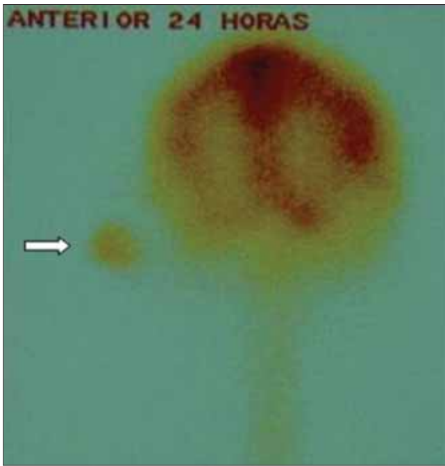
Figure 1. Cisternocintilografia - Previous - Suggestive of cerebrospinal fluid leak in the area of the right ear (arrow).