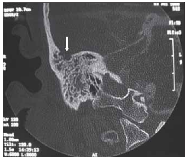
Figure 4. Cisternography of the temporal bone (coronal) - area of bony dehiscence in the tegmen tympani (arrow).

membrane. We opted for the withdrawal of ventilation tubes for while maintaining the same power to highlight the possible permanence of otorrhea, this could be ascertained by otoscopy by changes of the tympanic membrane . Moreover, the permanence of the vent pipe could facilitate the onset of infection.