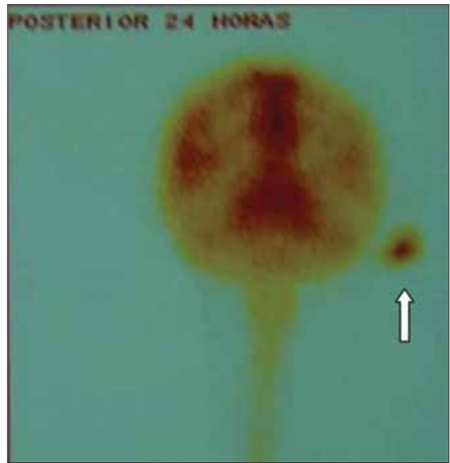
Figure 2. Cisternocintilografia - Rear - Suggestive of cerebrospinal fluid leak in the area of the right ear (arrow).