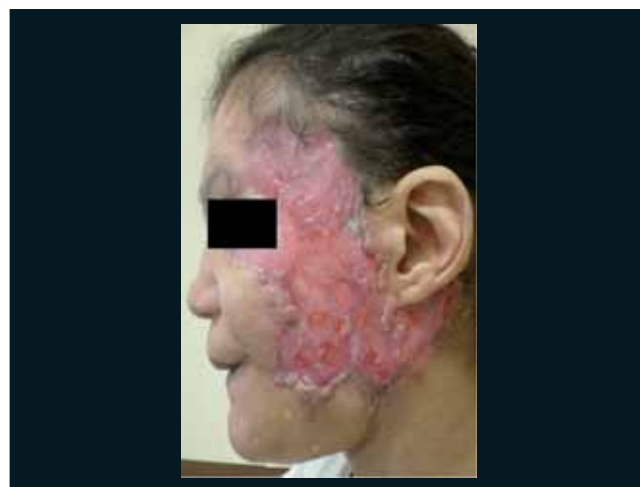
Figure 2. Face ulcer after treatment.