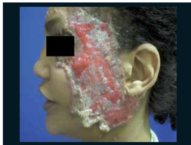
Figure 1. Ulcer of face before the treatment.

In the physical examination, it presented face with edge ulcer badly delimited and erythematous base with purulent pardon with some epithelized edge areas, occupying, practically, all left half-face. In inferior members, injury ulcerated in right leg. No longer otolaryngologic examination, there was in the previous rhinoscopy destruction of all nasal septum without areas of inflammatory process and in the oroscopy perforation of hard palate. The otoscopy was normal. It became endoscopy nasal visualizing ample septum perforation, mucous complete without aspect of active infection and presence of residues of mucus (Figures 1 to 6).