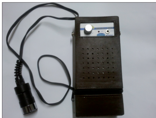
Figure 1. Sonar Doppler.

The statistical methodology used in this study consisted of descriptive analysis (average) and inferential statistics (significance test).