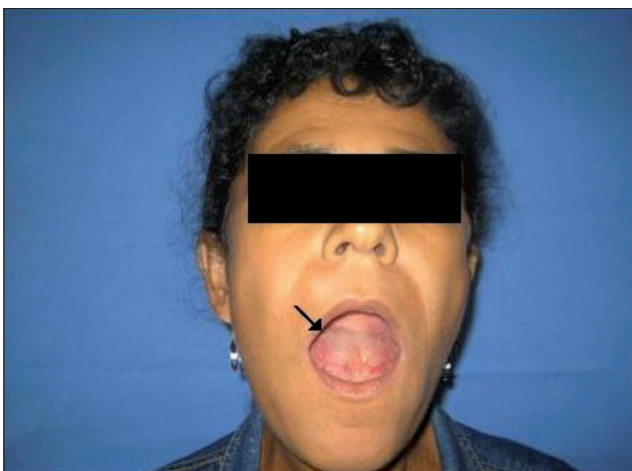
Figure 1. Patient with bulky lesion bulging floor of the mouth HC / UFG 2006.

The floor of the mouth can be compromised by a variety of injuries; many are major challenges to