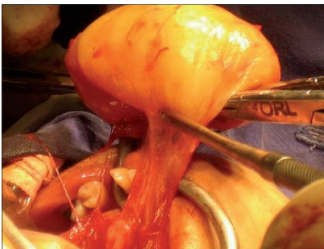
Figure 3. Surgical removal of the cyst. Capsule integrates. HC / UFG 2008.