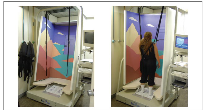
Picture 1. Dynamic Computerized Posturography.

Dynamic Computerized Posturography (DCP) complements the classical tests for vestibular involvement diagnosis which were redundant when investigating VOR (3). DCP is useful to check dizziness as a complementary exam for those patients who present complaints related to body balance which are not diagnosed by the conventional test. Its clinical importance is to diagnose the presence of body disorder and, then, if that is a result from a sensorial integration or afference to an inefficient motor response or even a combination of both. When DCP is compared to other vestibular tests, it provides diagnosis data in about 40% of the patients who present electronystagmography in normal condition (2). That happens as DCP evaluates vestibulospinal pathway which is not analyzed by the conventional tests. On the other hand, even patients who present DCP under normal conditions can present electronystagmography alterations. Therefore, DCP does not replace conventional vestibular tests, but it complements their findings and it is