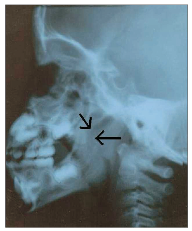
Picture 2. Important adenotonsillar hypertrophy (arrow) to cavum X-ray.

Seven months afterwards, patient underwent a new Doppler echocardiogram presenting normal activity of the left and right ventricle; tricuspid and pulmonary valves with normal opening, thickness and movability and pulmonary artery and branches with normal caliber. This revealed a normal result exam under anatomic aspect, what assured reversal of all alterations from the first echocardiogram.