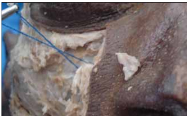
Picture 2. Access to the maxillary sinus (Caldwell-Luc).