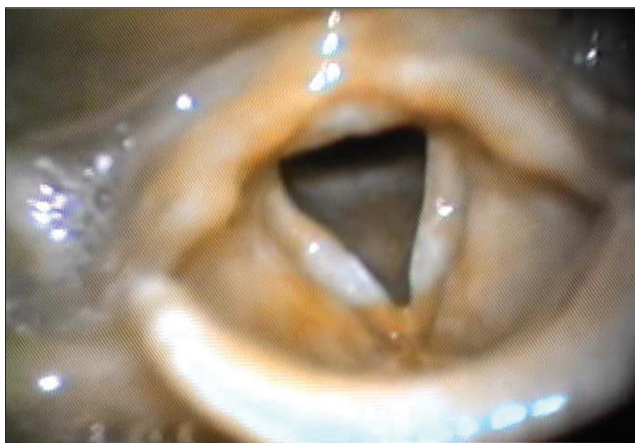
Picture 1. Chronic laryngitis. Video-laryngoscopy showing hyperemia and edema of vocal cords with leukoplakia, bilaterally.

Case 1 – ENS, 26 years old, female, white, housewife, presented with normal otorhinolaryngological exam, except for the vocal cords that, upon video-laryngoscopy, presented with hyperemia, slight edema and bilateral leukoplakia in