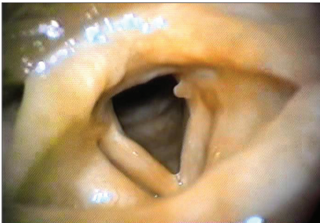
Picture 2. Chronic laryngitis with granuloma. Video-laryngoscopy showing hyperemia, edema and granuloma in the posterior third portion of the left vocal cord.

middle third (Picture 1). She was medicated with corticosteroids and phonaudiologic therapy was recommended.